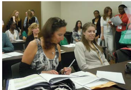
A classroom full of mentors and students listening to a presentation