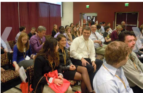
Students and professors listening to a key note speaker