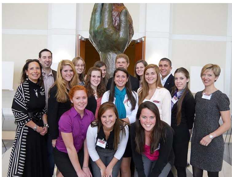
Students and professors at a conference together

critical and creative thinking, and provide students with privileged opportunities to add to the sum of human knowledge.