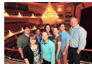
Students and professor who attended the American College Theatre Festival