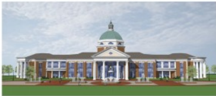
HIGH POINT UNIVERSITY

competences, foster critical and creative thinking, and provide students with privileged opportunities to add to the sum of human knowledge.