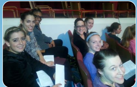
Dance students at the ACDA conference