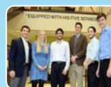
Grants, Conferences, and BigSURS 2015