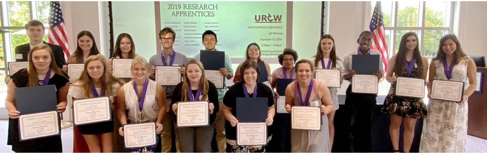
Recent Research Apprentices *see page 2

The Office of Undergraduate Research and Creative Works (URCW) is pleased to welcome students, faculty, and staff to another academic year at High Point University! Our monthly newsletter is designed to keep you up to date with student accomplishments and opportunities within the realm of collaborative, creative and scholarly works. By sharing our students' many achievements, we hope to encourage your participation in URCW this semester!